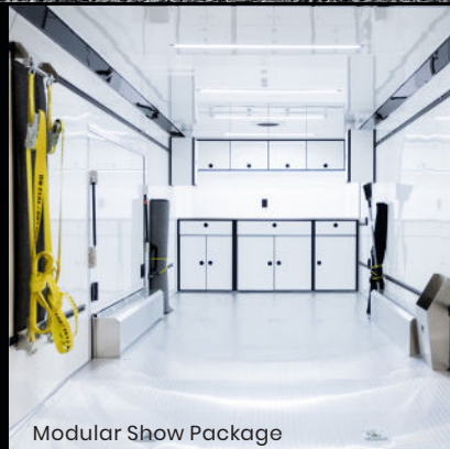
Modular Show Package