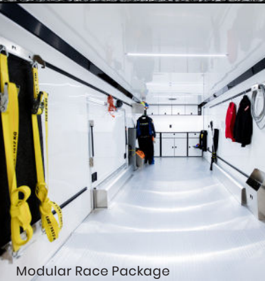
Modular Race Package