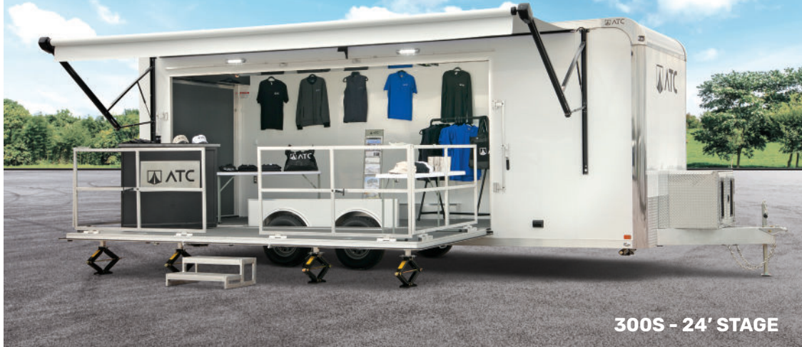
300S - 24' STAGE

These versatile trailers will get your business noticed. Choose from our lightweight, aluminum Stage or Vending Trailers.