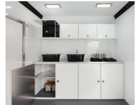
300V - 24' VENDING